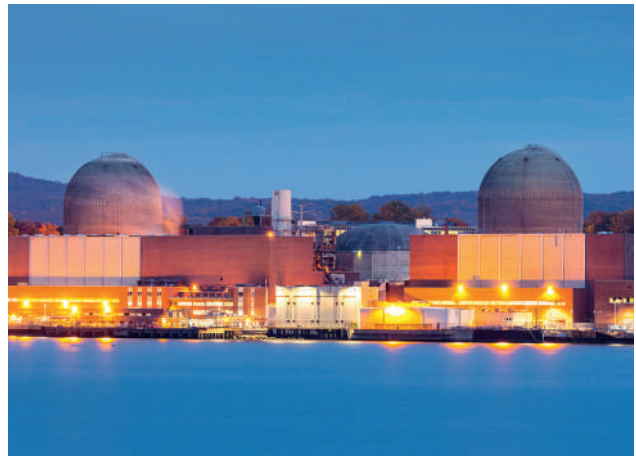
Nuclear Power Plant